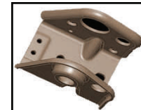
Seat Track GMT 800