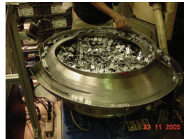
Sensored Bowl system to check for possible defects